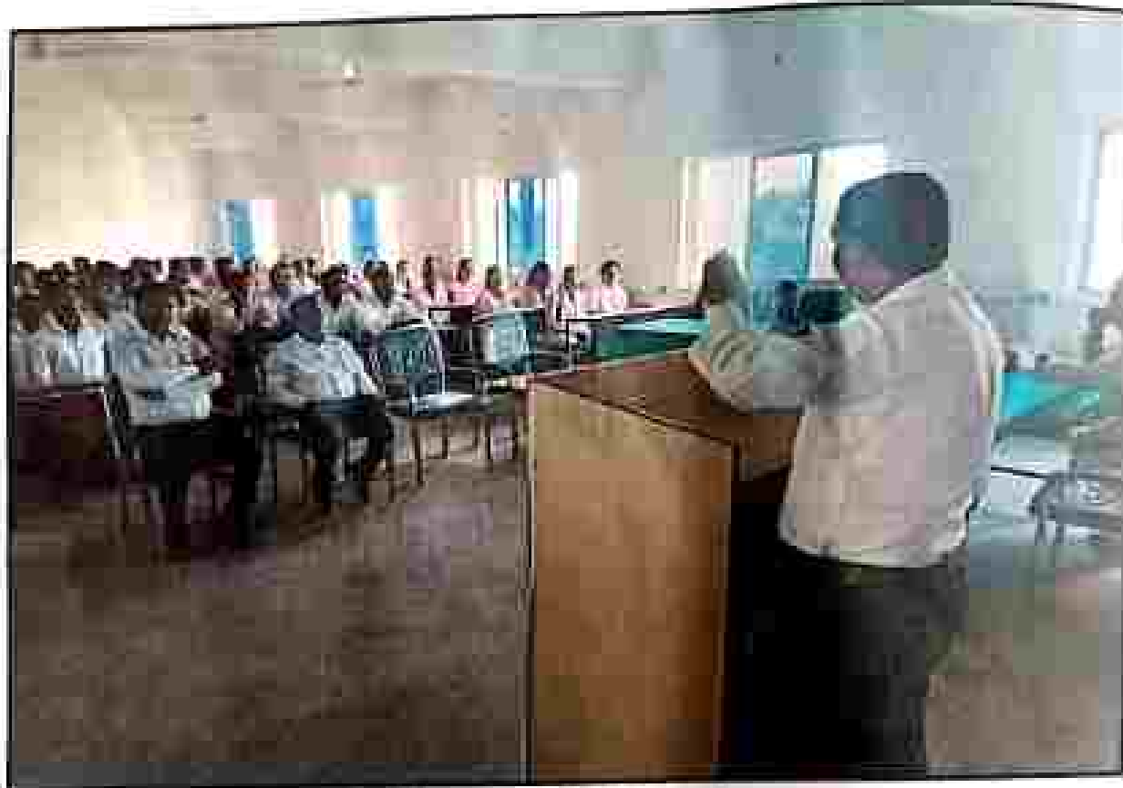
Special Lecture by Expert