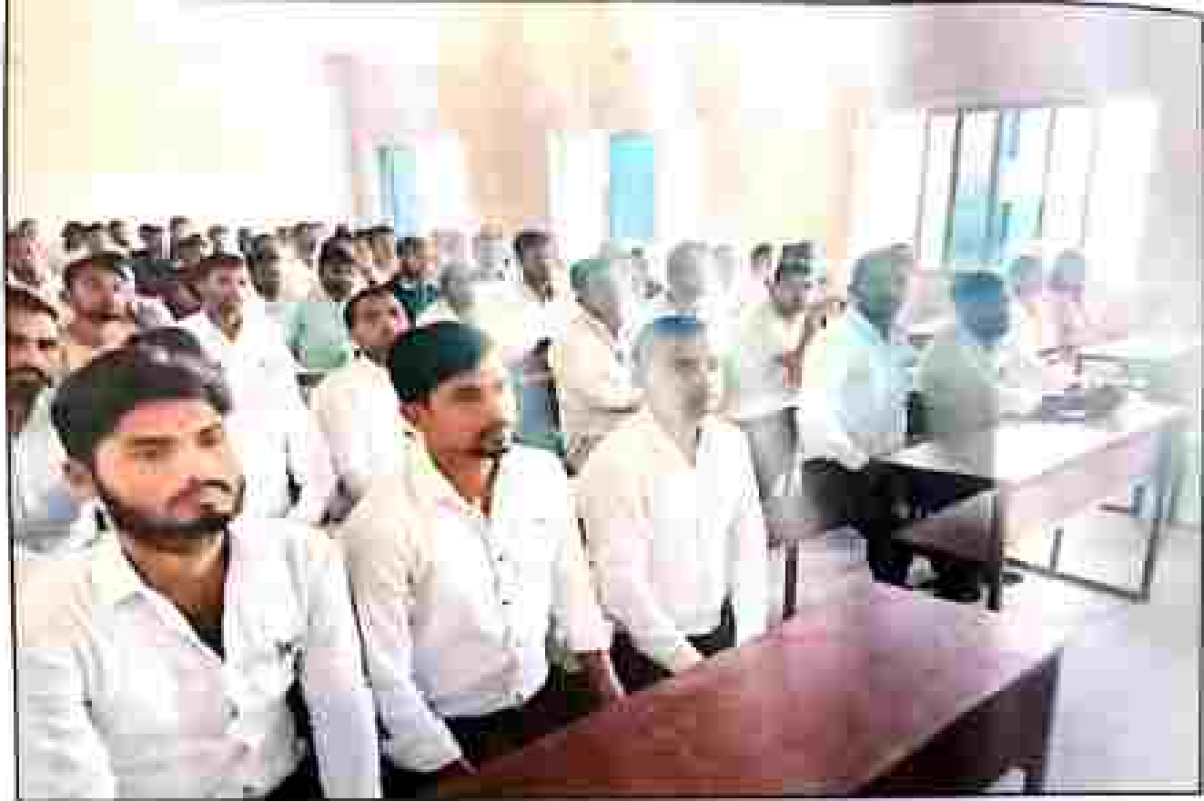
Special Lecture by Expert