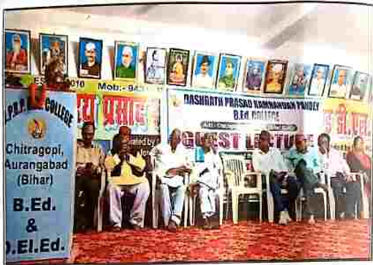
GUEST LECTURE ON RECENT POLICIES NATIONAL EDUCATION POLICY 2020