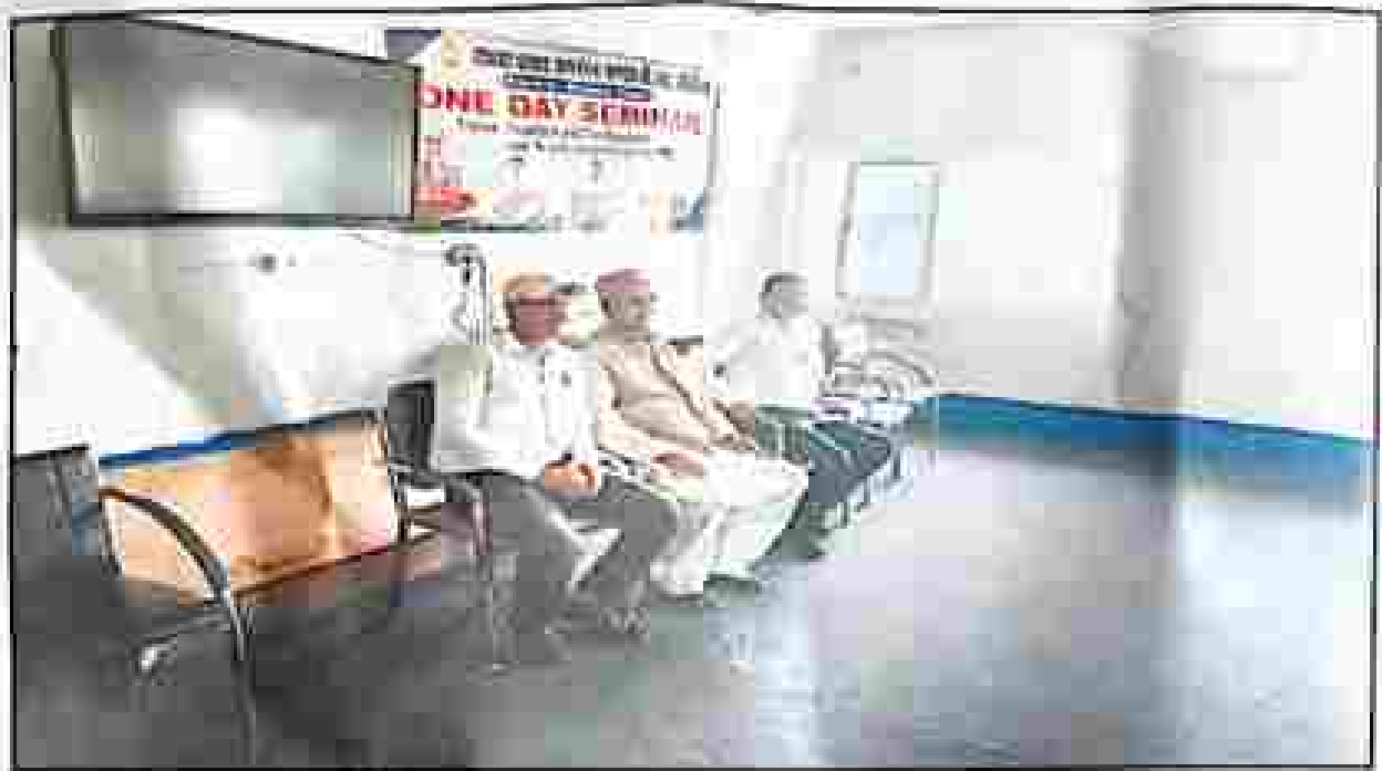
(One Day Seminar on Importance Of ICT in Education and Teaching Learning Process)