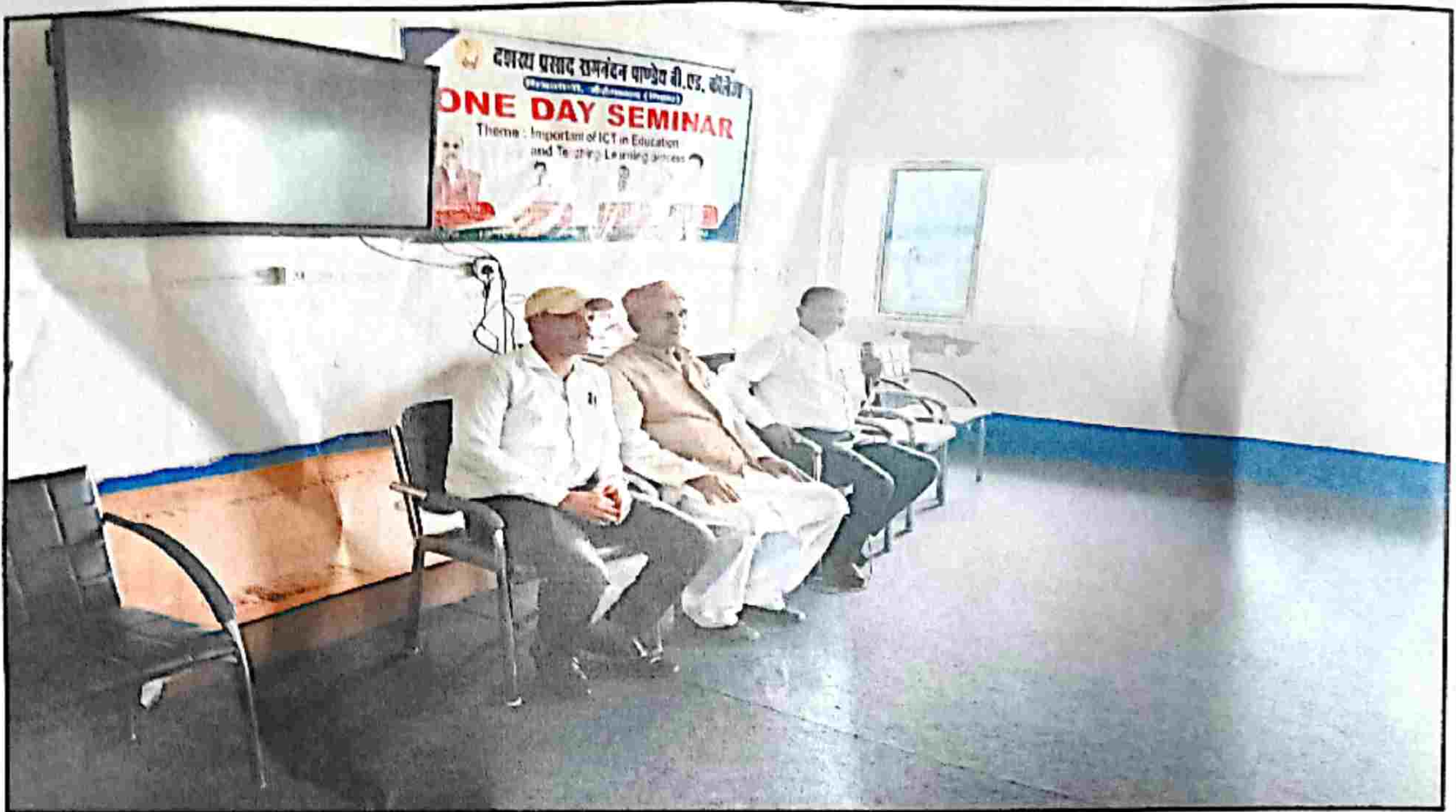
(One Day Seminar on Importance Of ICT in Education and Teaching Learning Process)